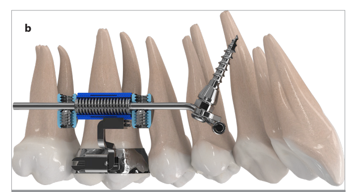
Figure 1. a, b. Three-dimensional virtual representation of the amda® (a) Occlusal view, (b) Sagittal view

well as the anchorage loss of the posterior dental unit (in terms of mesial movement of the molars that have been previously distalized) during anterior teeth retraction (Figure 3b). During molar distalization with amda*, the molars are distalized almost bodily, while the appliance remains invisible (11, 12). Thereafter, the same appliance after a small chairside intraoral modification can provide the necessary anchorage for the subsequent anteri-