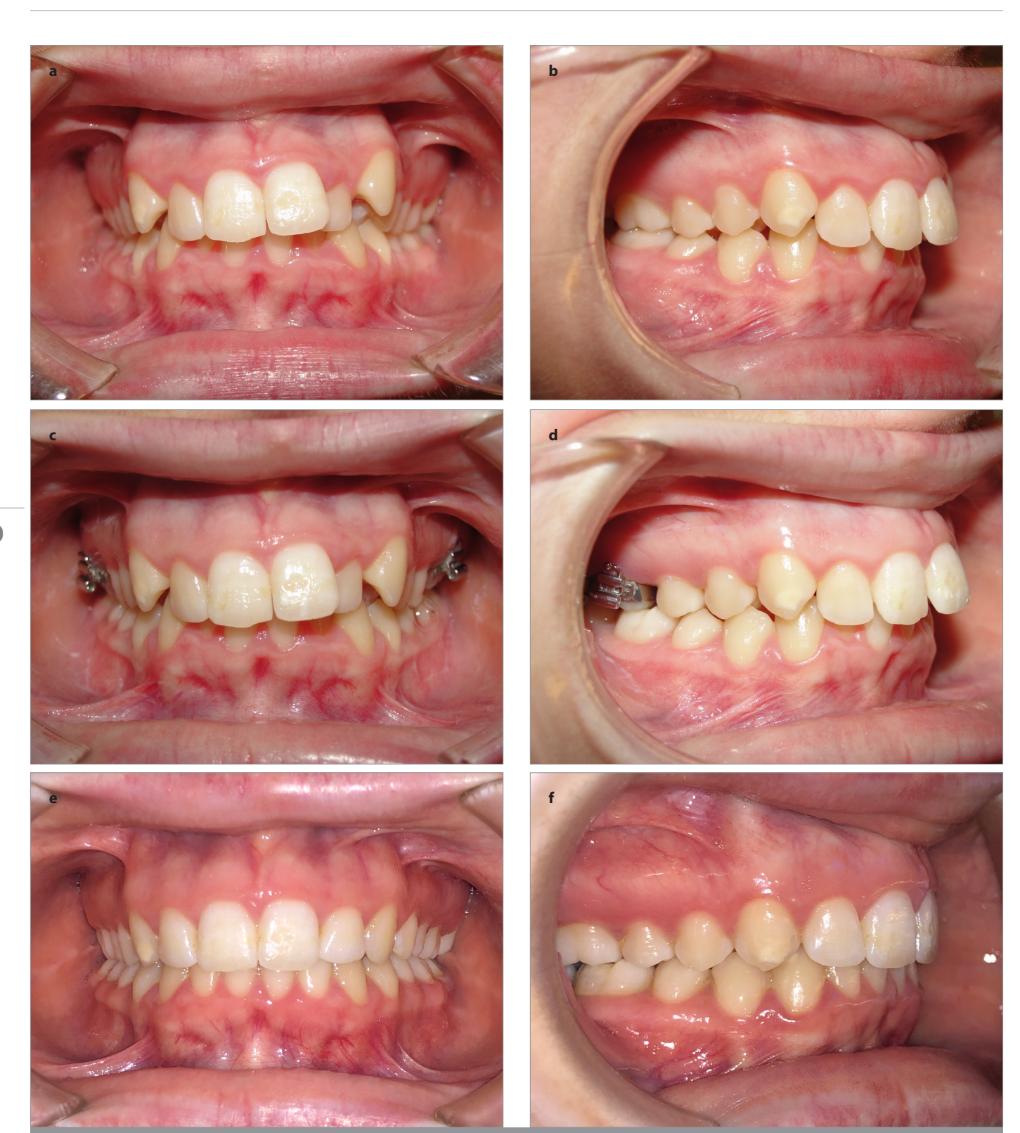
Figure 4. a-f. Intraoral photographs of a 13-year-old female with Class II malocclusion Treated with the amda®: (a, b) Before initiation of treatment; (c, d) Immediately after completion of distalization of the maxillary molars with the amda®; (e, f) Immediately after completion of treatment and after debonding of the maxillary and mandibular dental arch

As mentioned above, the amda® uses two TADs as stationary anchorage to resist the mesial-directed reciprocal forces produced by the coil springs during molar distalization, as well as later to support the subsequent anterior teeth retraction. This way, the side effects of anchorage loss of the anterior dental unit during molar distalization and that of the posterior dental unit during